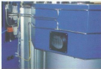
Fume exhaust hood for easy connect with ventilation tube