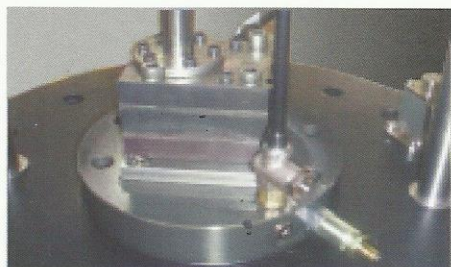
Built-in pressure relief valve to adjust adhesive output pressure. Pneumatic pressure relief valve in option.