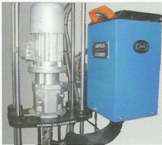
Optional cleaning tank