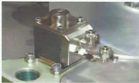
BDrum Series includes air injection module.