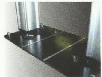
New drum fastening system for faster drum changes