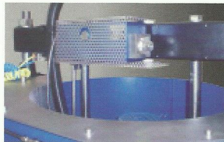
Optional filter manifold ensures cleaner applications.