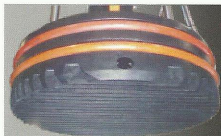
Finned or flat platens better adapt to various adhesive types. All platens are Teflon® coated and include cast-in heaters.